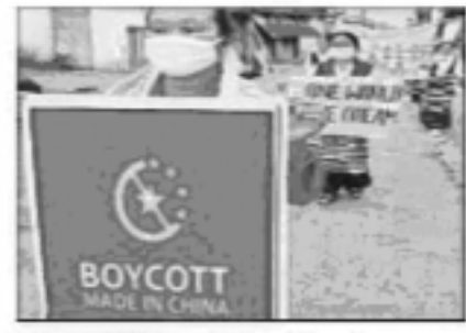
View of the rally in Arjuni Morgaon.

movement of the Tibetan Youth Congress, while those students born in India had a more conciliatory attitude. For these young Tibetan-Indians, it does not matter anymore if Tibet is part of China. Tibetans are now not just in India, but are spread around the world as diaspora. For these young Tibetans (including the Karnataka, India born Fulbright scholar) more than territorial freedom of Tibet from Chinese occu-