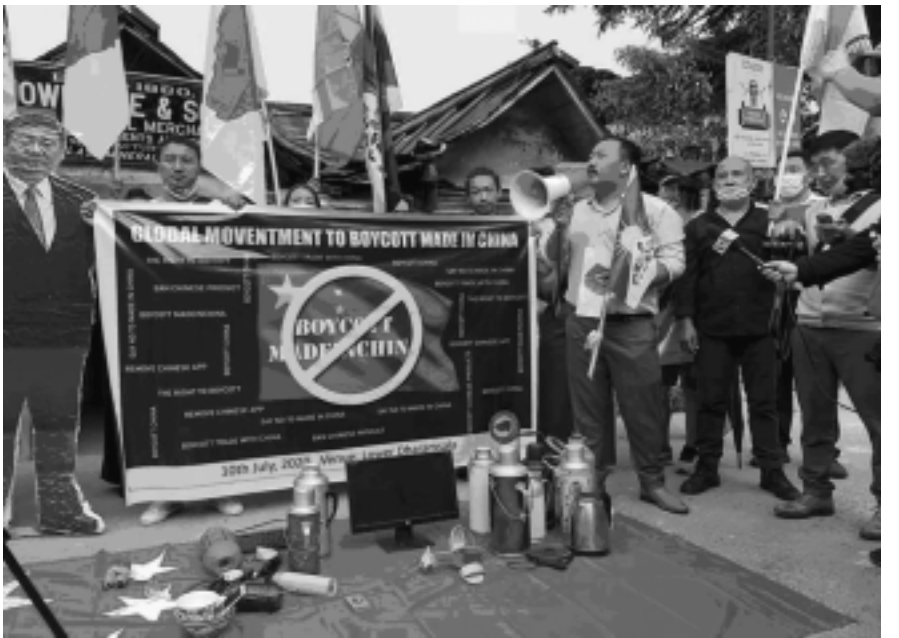
IMAGE3 TYC Launch of the Global Movement to Boycott Made in China

'Political activism is of course the main means by which people have sought to change society. The pursuit of cultural rights however, also entails cultural activism, which can take many forms.'