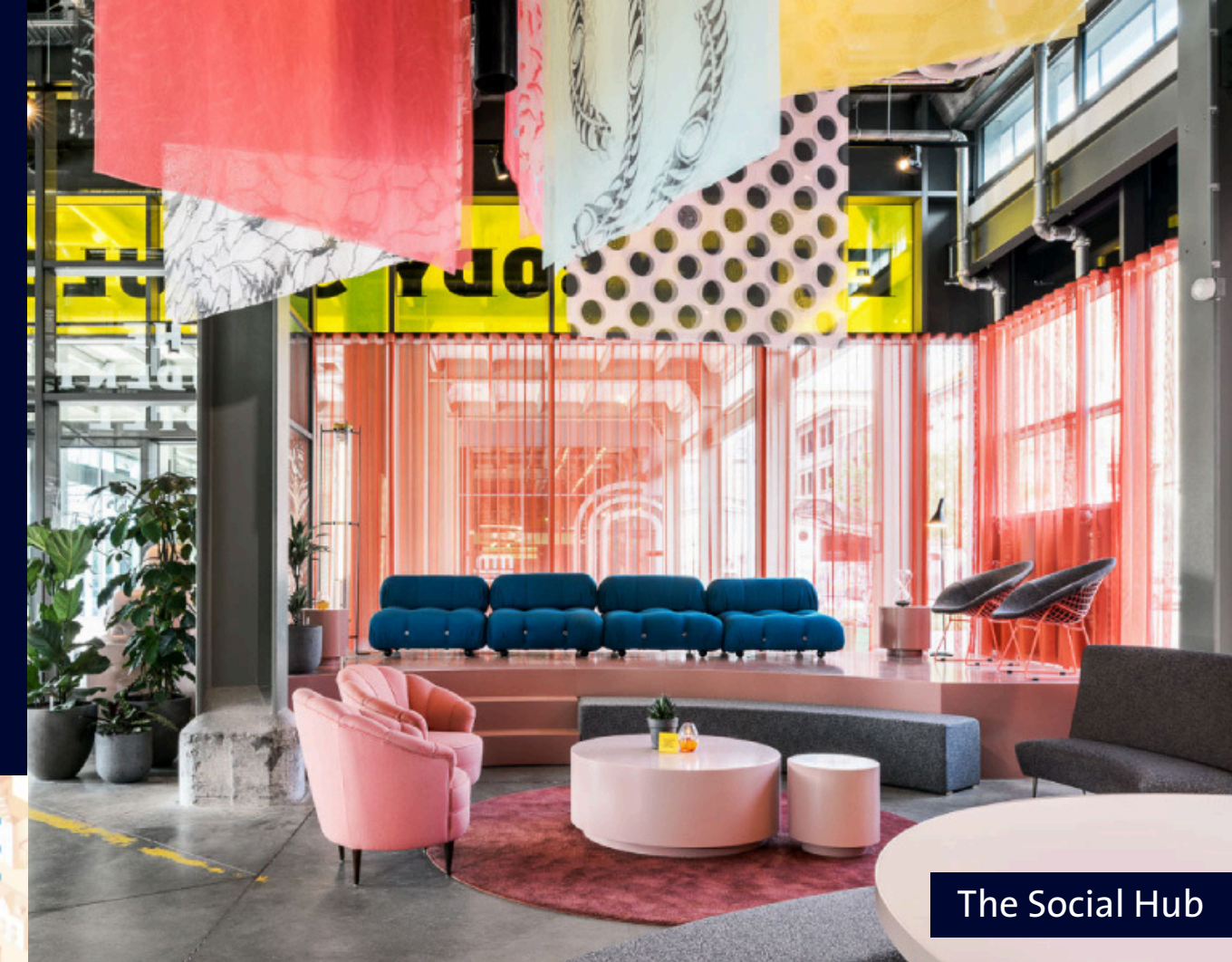
The Social Hub