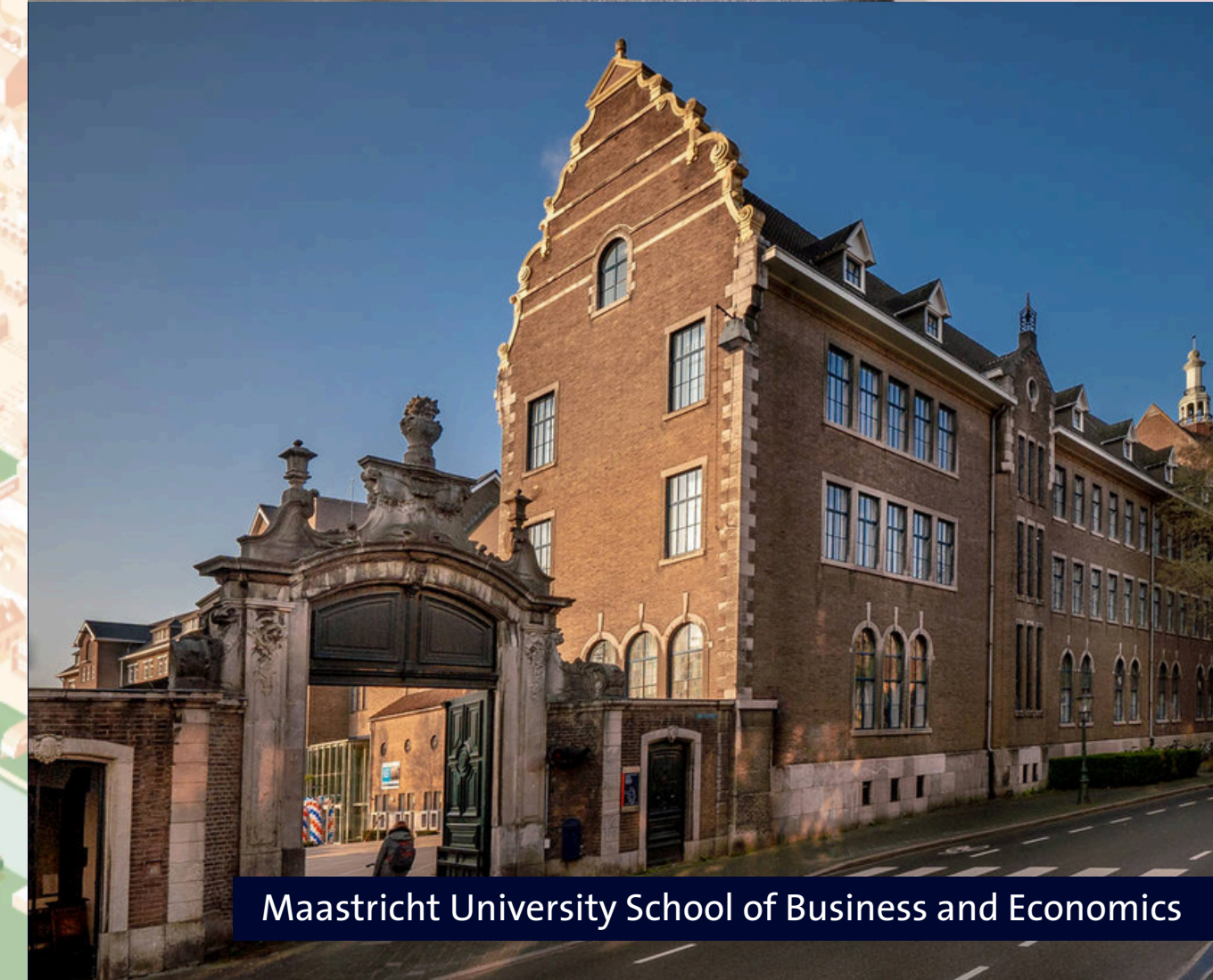
Maastricht University School of Business and Economics