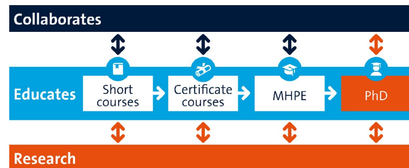
Figure 3. Double Chain approach of SHE

and impact: research covers the spectrum from application-oriented educational research to conceptual contributions to relevant (educational) theories in HPE. These research findings then not only inform SHE's educational activities, but also improve quality and innovation at FHML/MUMC+. SHE Collaborates is vital to help other educational institutes and healthcare organizations apply this knowledge too and, in the process, create new research opportunities. The second chain focuses on impacting individuals and teams: beginning with short courses for those new to HPE, followed by certificate courses on specific topics, then the MHPE program for aspiring academic educators, leaders, or researchers, and culminating in a PhD program for those aiming to become scholars in health professions education. It is not uncommon for students to first take a short course and end up doing research in the PhD programme.