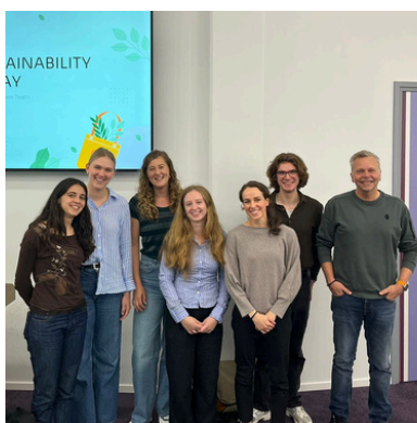
FHML Sustainability Day