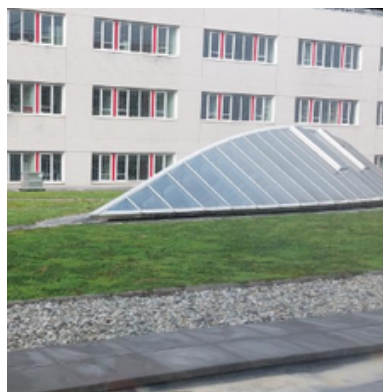
UNS40 Green Roof