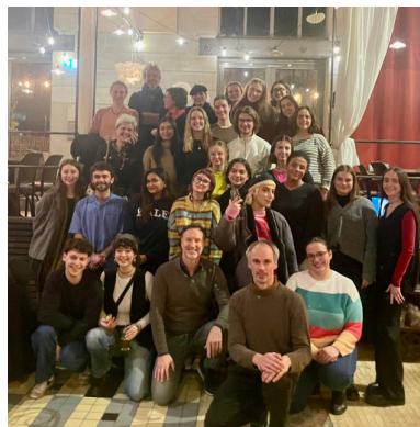
Lumière movie night