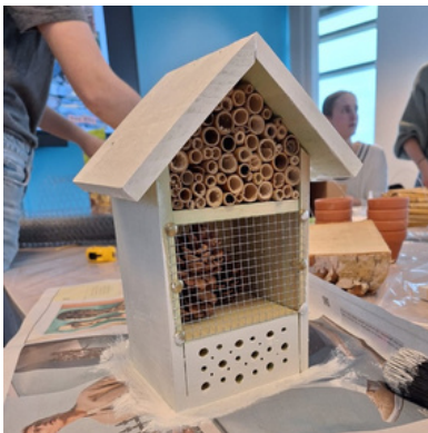
Insect Hotel Workshop