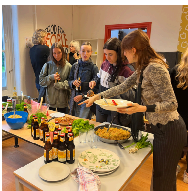
Sustainability Festival Dinner