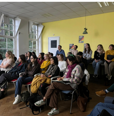
Green Network Mixer