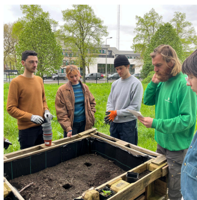
Community Garden Plant Boxes