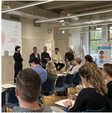
Transition Platform “Shock Box”