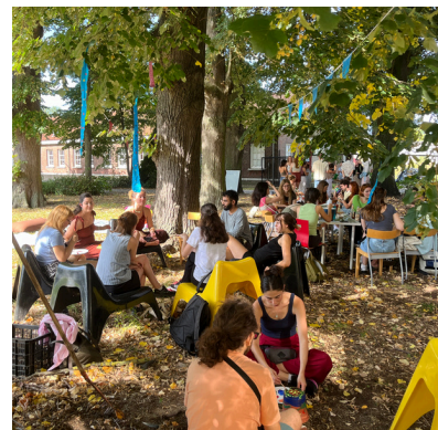
Community Garden Summer