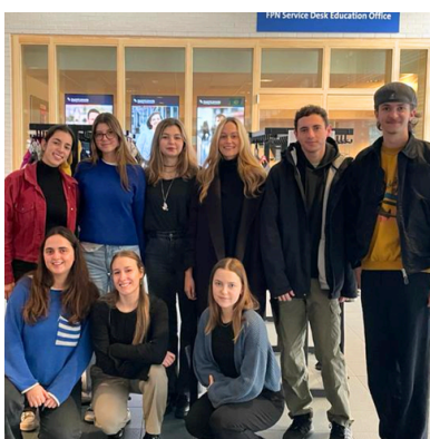
FPN Green Team