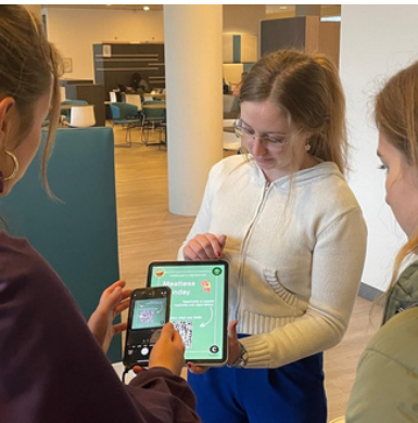
Eurest Meatless Mondays