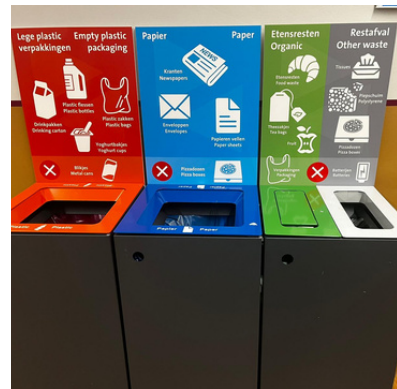
New Waste Management