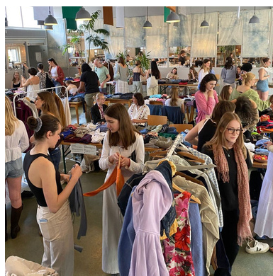
Clothing Rack Event