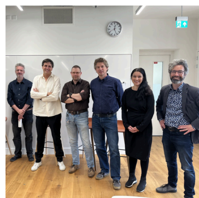
Transition Platform Program