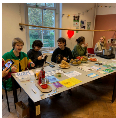
Hub Fest Infomarket