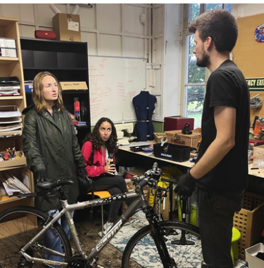
Bike Repair Workshop