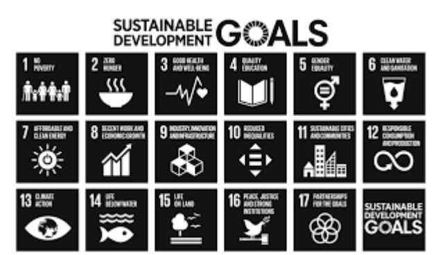
Figure 1: The 17 UN Sustainable Development Goals

Design thinking is often seen as a key literacy and a form of problem-based-learning as it requires active participation in meaning-making and knowledge-creation. In this project students will engage with 'wicked' societal problems by using Design thinking to find a solution to an issue associated with one of the 17 UN Sustainable Development Goals (Figure 1).