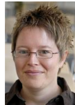
Dr. Zeiss Science & Technology