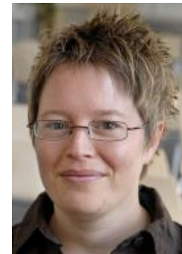
Dr. Zeiss Science & Technology