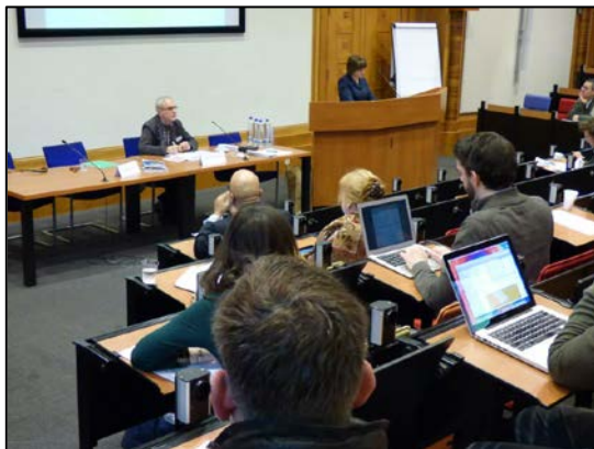
Conference: Denialism and Human Rights