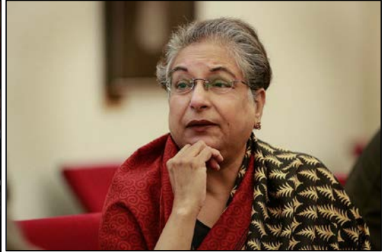
5<sup>th</sup> Theo van Boven Lecture: Hina Jilani and Human Rights Defenders on the Front line