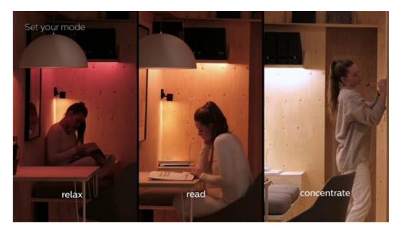
Figure 2: Philips HUE lighting system