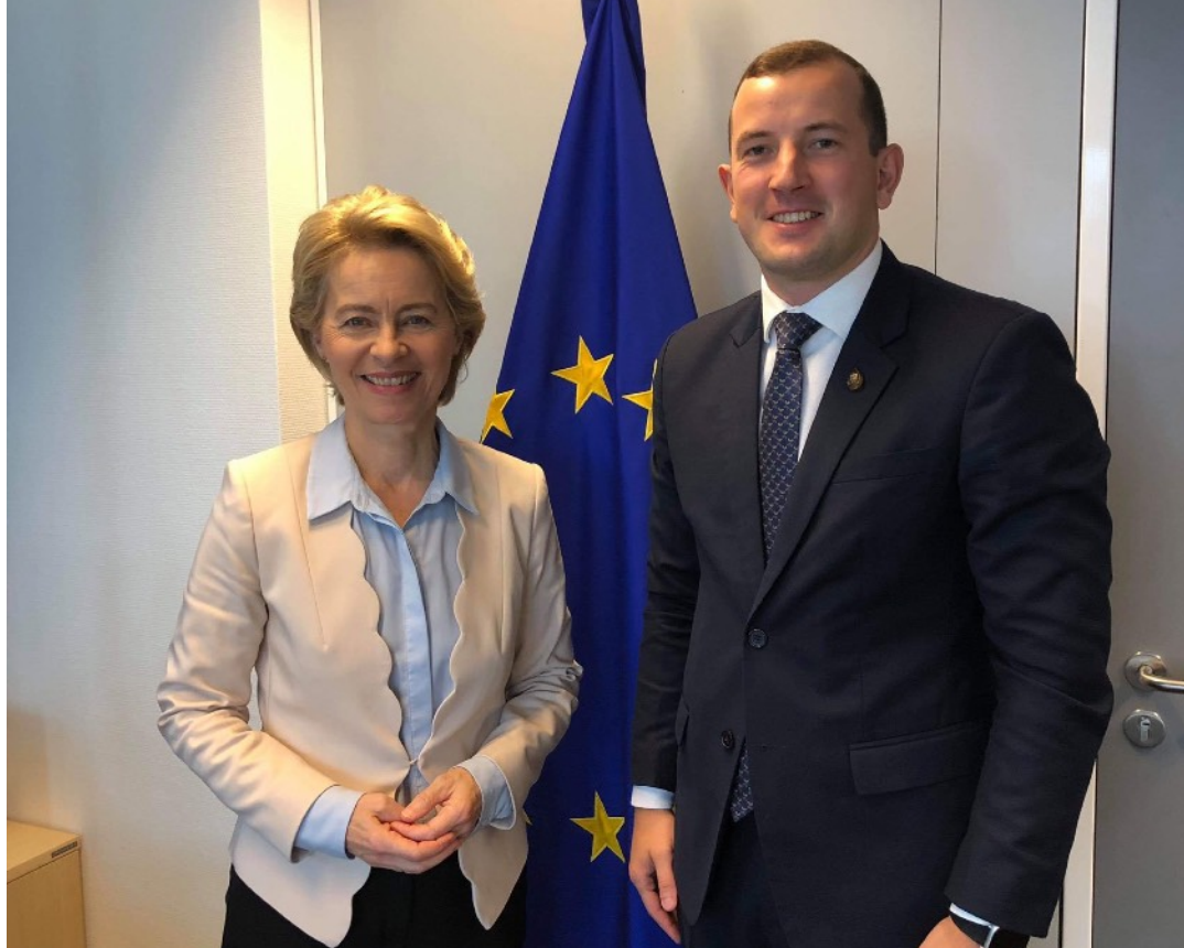
Virginijus Sinkevičius, European Commissioner 2019-2024 MA in European Studies 2012-2013