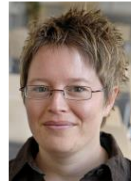
Dr. Zeiss Science & Technology